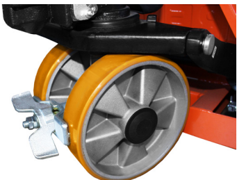
Foot parking brake (3410000)